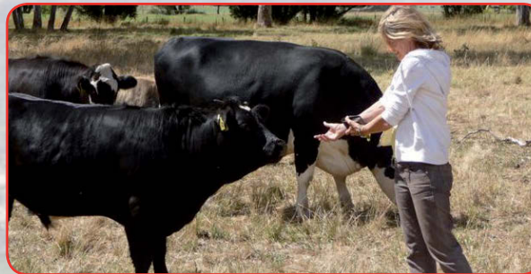
■ NEWMAN ORGANIC BEEF, ADELAIDE HILLS SUPPLY INTO P & A MEATS