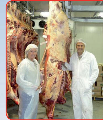
■ RADFORD'S, WARRIGUL (Beef for Heathmont Meat & Poultry)