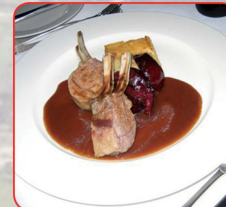
■ NELYAMBO MERINO ORGANIC RACK OF LAMB, HENRY'S DRIVE

RURAL ORGANICS SUPPLIES CERTIFIED ORGANIC & BIO-DYNAMIC MEAT INTO ADELAIDE, MELBOURNE AND SYDNEY BUTCHER SHOPS, RESTAURANTS AND SPORTING VENUES