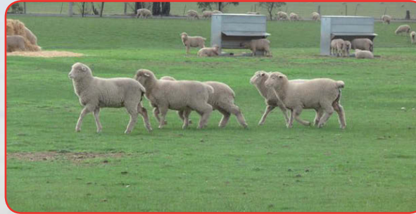
■ SUNNINGDALE BIO-DYNAMIC LAMBS, BENDIGO SUPPLY INTO KOKICH BELMORE BIO-DYNAMIC MEATS