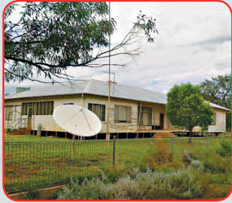
■ MUSEROO HOMESTEAD/ NELYAMBO SYDNEY ROAD