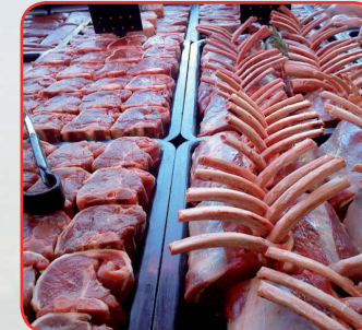
■ DOHNES AT AWARD WINNING RENDINA'S BUTCHERY

RURAL ORGANICS SUPPLIES CERTIFIED ORGANIC & BIO-DYNAMIC MEAT INTO ADELAIDE, MELBOURNE AND SYDNEY BUTCHER SHOPS, RESTAURANTS AND SPORTING VENUES