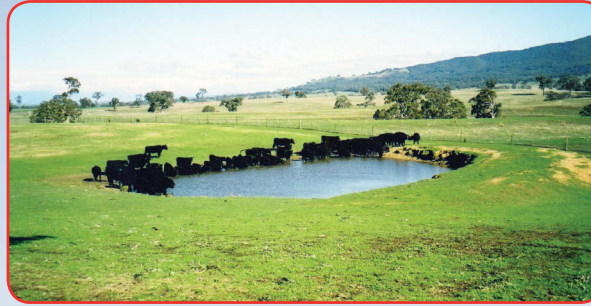
■ BARJARG BIO-DYNAMIC BEEF, MANSFIELD SUPPLY INTO HAGENS ORGANIC MEATS