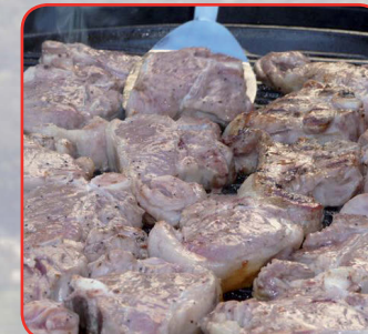
■ FITZPATRICK BIO-DYNAMIC DERBY DAY CHOPS FLEMINGTON