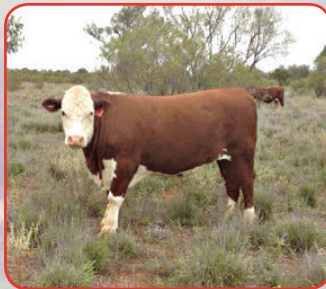
■ NSR HEREFORD STEER BRED FOR THE CONSUMER