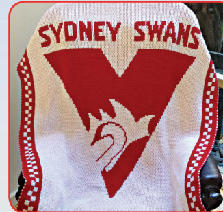
■ SYDNEY SWANS

ORA - Rural Organics promotes a healthy & balanced lifestyle!