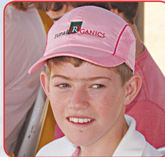
■ PINK STUMPS